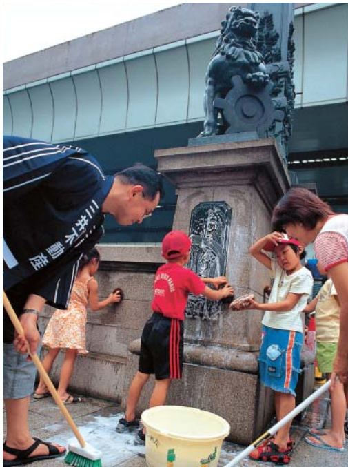
Mitsui Fudosan employees volunteer at the grassroots level to contribute to the Nihonbashi area in ways such as participating in neighborhood cleaning and beautification programs.

Mitsui Fudosan's sponsorship of annual events includes the Tokyo Summer Festival, which introduces music from around the world, and the Sumida River Fireworks, one of the most famous fireworks displays in Tokyo. We also sponsor Flower Highway, an annual event that decorates a central Tokyo thoroughfare with flowers.