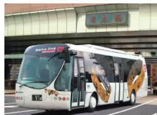
Tokyo Metrolink, sponsored in part by Mitsui Fudosan, is a convenient electric shuttle that serves the Nihonbashi area.

The Mitsui Group originated in the Nihonbashi district of Tokyo. Throughout its history, Mitsui Fudosan has participated in and supported local organizations, such as the Nihonbashi Area Renaissance 100-Year Planning Committee and the Preservation Society for the Famed Nihonbashi Bridge, and has been building strong ties with local communities by sponsoring annual events. We also contribute to the revitalization and restoration of the area through urban redevelopment projects that respect and pass down the traditions and culture of the area. Since April 2003, the Nihonbashi Urban Planning and Development Department has been building even stronger ties with the local community while bringing new energy to the area.