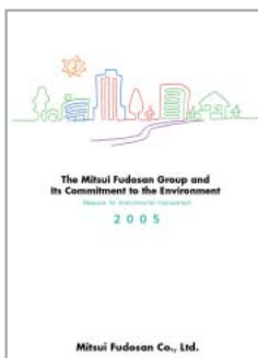
The Mitsui Fudosan Group and Its Commitment to the Environment 2005

environmental impact include preventing pollution, strictly observing environmental laws, and setting independent standards when necessary. The Group raises employee awareness of environmental policies through education and other activities, and promotes information disclosure to keep society and local communities informed of our environmental measures and their results.